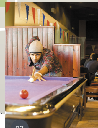
Students' Union 1.3 miles ⤴ 28 mins ⤴ 8 mins