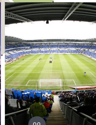
Reading FC's Madejski Stadium 2.7 miles ⤴ 17 mins ⤴ 32 mins

Please note this map is an artistic representation of the University of Reading campus and surrounding area. Not to scale.