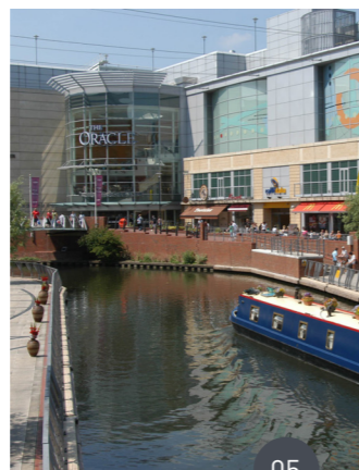
Oracle shopping centre 0.8 miles ⤴ 5 mins ⤴ 6 mins