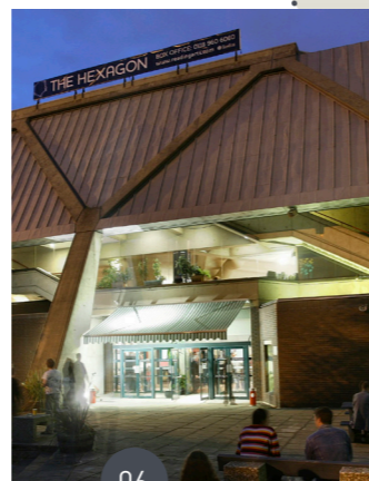
Hexagon Theatre 1.2 miles ⤴ 7 mins