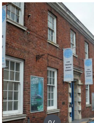
South Street Arts Centre 0.2 miles ⤴ 2 mins